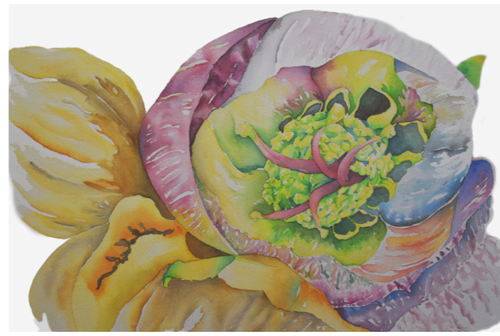
Tentacles - Ellebore - 2022