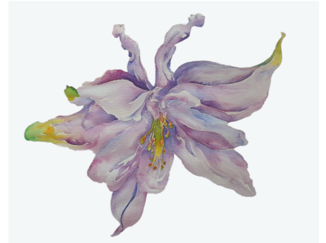
Pas de deux - Aquilegia - 2022