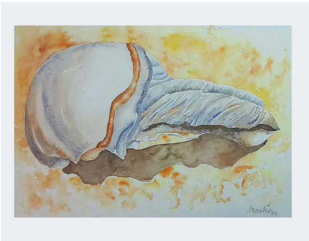
Stone - bird skull - 2021