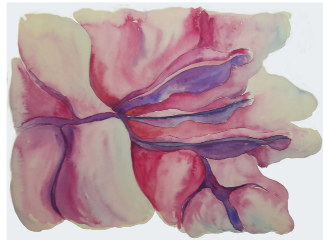
Inside a Bougainvillea - 2023