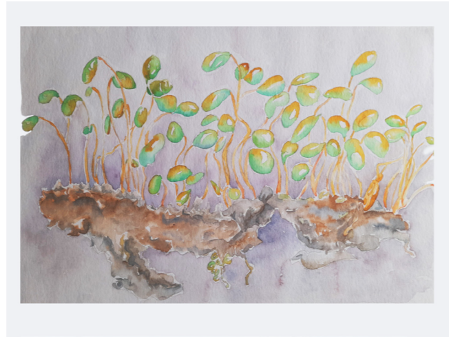
Turfsole - 2023