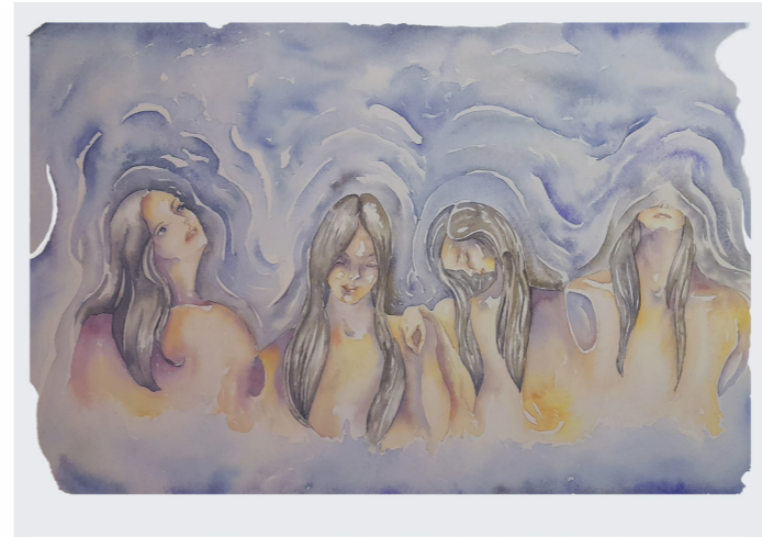
Currents - 2023