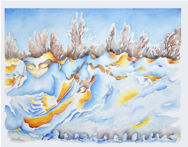
Snowqueen - 2021