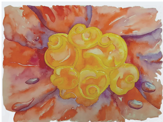
On fire - Begonia - 2023