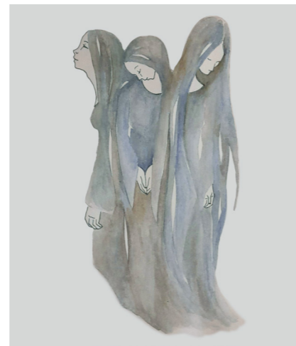
Sisters of pain - 2023