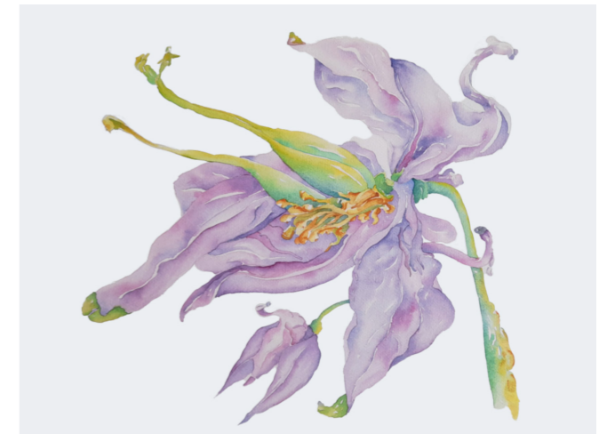
Swan song - Aquilegia - 2022