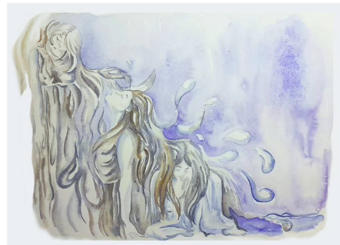
Chain of guilt - 2023